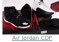
Air Jordan Retro 13 XIII shoes black cream ID:5660 Free Shipping